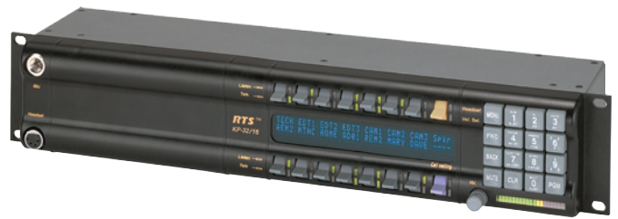
KP-32/16 16-Position Keypanel