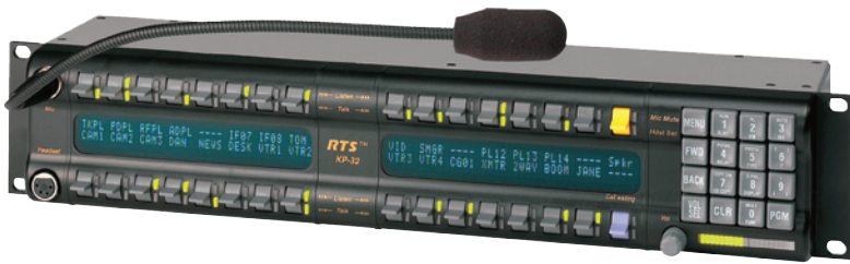
KP-32 32-Position Keypanel